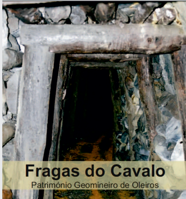
Leaflet about Geomining Heritage of Oleiros